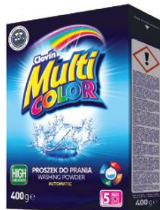
MULTI COLOR Washing powder 400 g/5

Multicolor - universal washing powder that works well in all types of washing machines in the full temperature range and in hand wash. Its formula allows for effective care of both white and coloured clothes. Extremely efficient. Packages in 7 variants - tailored to the customer's needs. Multicolor washing powder was created not only for the convenience of the consumer but also for the protection of the natural environment. Its extraordinary efficiency means that even a small amount of powder will allow you to perform effective washing. As a result, less pollution will end up in the natural environment. Multicolor washing powder is a thoughtful purchase. The numbers speak for themselves - 10 kg of the product is enough for 133 washes.