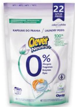
Clever Neutro+ Hypoallergenic laundry capsules color&white 396 g/22

The Clever Neutro Plus line is the most ecological washing product on the market. Both : safe for the skin and the environment. Biodegradable and Hypoallergenic. It is a response to the needs of over 30% of consumers who, according to research, have a problem with allergies. Thanks to the modern NEUTRO technology, this product is completely free of allergens, i.e. all sensitizing substances like fragrance and enzymes. It is also devoid of allergenic zeolites, the presence of which has a bad effect not only on human skin, but also on the natural environment. This product is dermatologically tested, it can be safely used by people with sensitive and prone to irritation skin. Its special formula ensures an even lower dosage, thus saving natural resources, water and energy. It has the ECOLABEL certificate - which is a certificate awarded by the European Commission to products which entire life cycle has the least impact on the natural environment and is the main European distinction awarded to products that meet higher environmental standards. It undergoes rapid and absolute biodegradation in accordance with the stringent standards of the European Union (OECD 301F) and is recommended for farms with home sewage treatment plants.