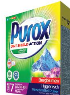
Purox Universal Washing powder 490 g/7