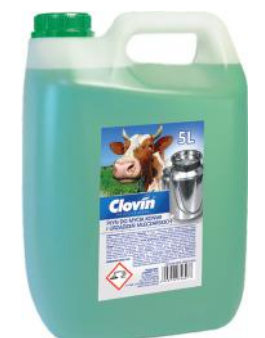
Liquid for cleaning milking buckets