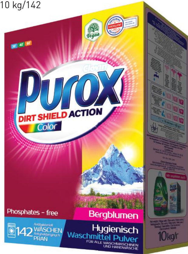
Purox COLOR Washing powder 10 kg/142