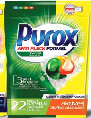
Purox Universal Laundry capsules 396 g/22