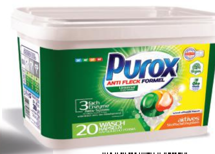
Purox Universal Laundry capsules 360g/20