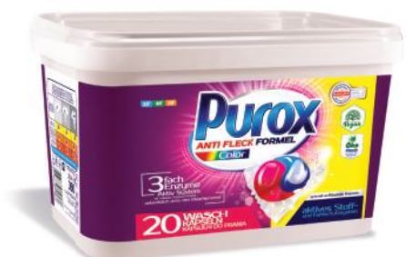
Purox COLOR Laundry capsules 360g/20