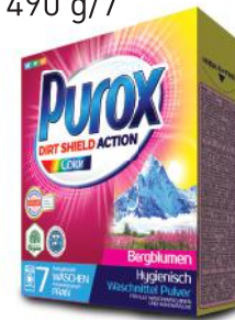
Purox COLOR Washing powder 490 g/7