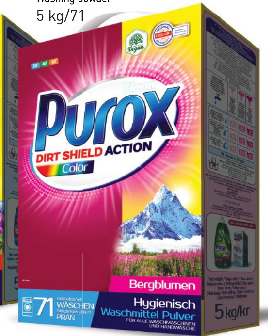
Purox COLOR Washing powder 5 kg/71