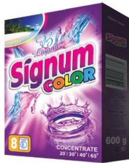
SIGNUM COLOR Washing powder 600 g/8

The Signum line is effective, efficient and environmental friendly in all types of washing at the same time having a very nice fragrance line. Good value for money.