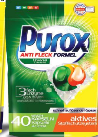
Purox Universal Laundry capsules 720g/40