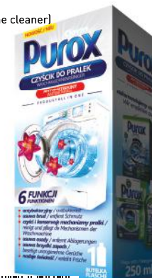
Purox CLEANER (washing machine cleaner) 250 ml