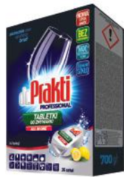
dr. Prakti Dishwasher tablets 700 g/35

All dr.Prakti dishwasher products are free from harmful phosphates. The excess of phosphates causes the growth of algae in rivers and lakes, significantly limiting the development of other organisms. Since the beginning of 2017, the European Union standard has been in force, which prohibits the use of phosphates in dishwasher detergents. The products for dishwashers produced by Clovin were created without these harmful substances and are environmentally friendly and protect the dishwasher against limescale.