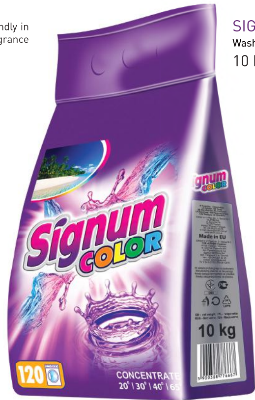
SIGNUM COLOR Washing powder 10 kg/120