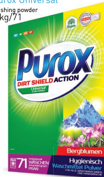
Purox Universal Washing powder 5 kg/71