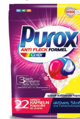
Purox COLOR Laundry capsules 396 g/22