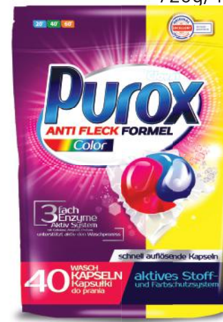
Purox COLOR Laundry capsules 720g/40